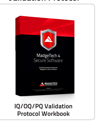
IQ/OQ/PQ Validation Protocol